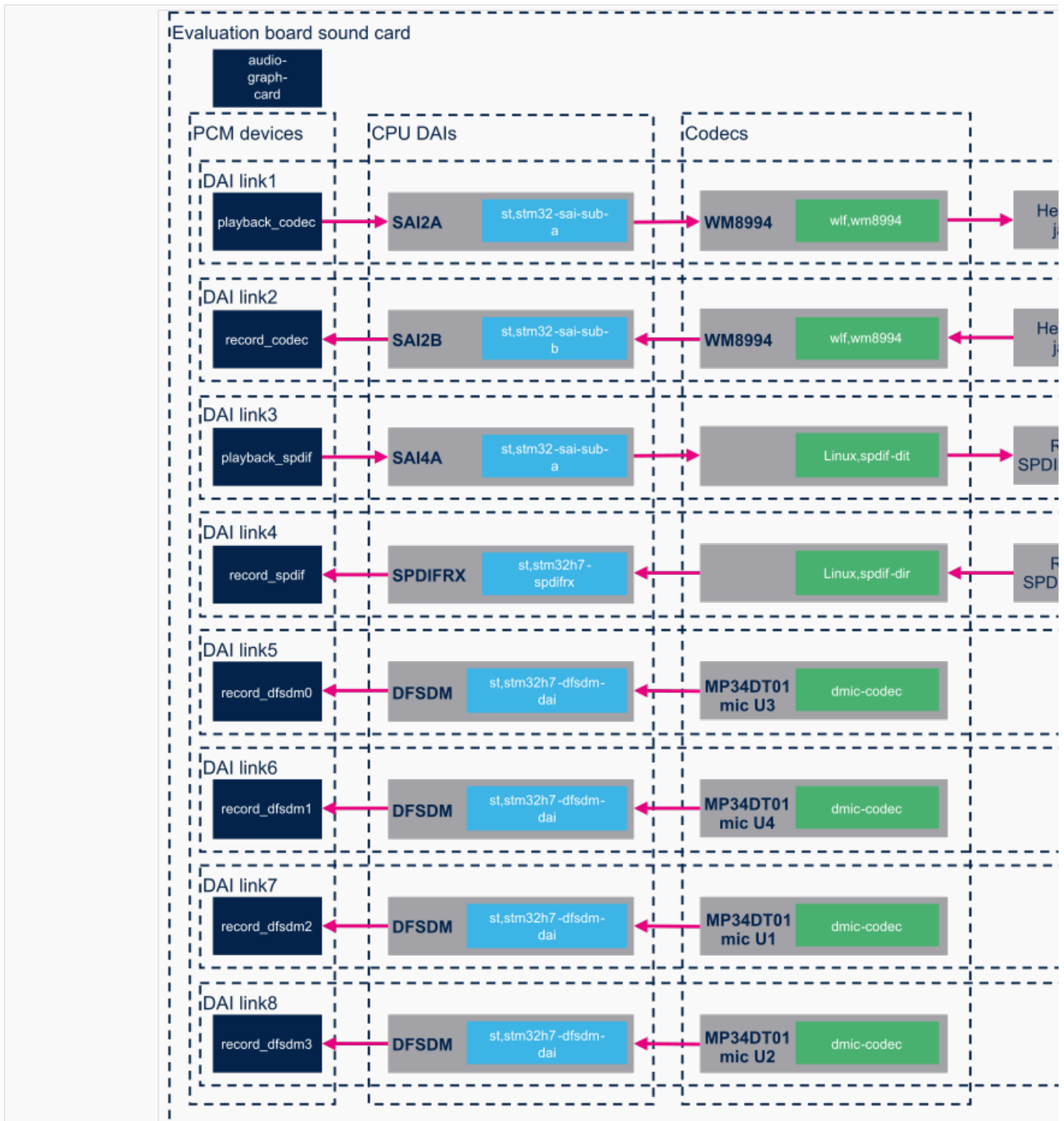
STM32MP15 Evaluation board sound card